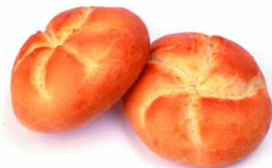
The largest convection fan available ensures golden perfection.