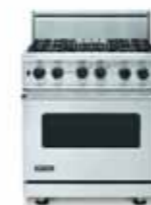
VDSC530 Dual Fuel 30" Wide Range