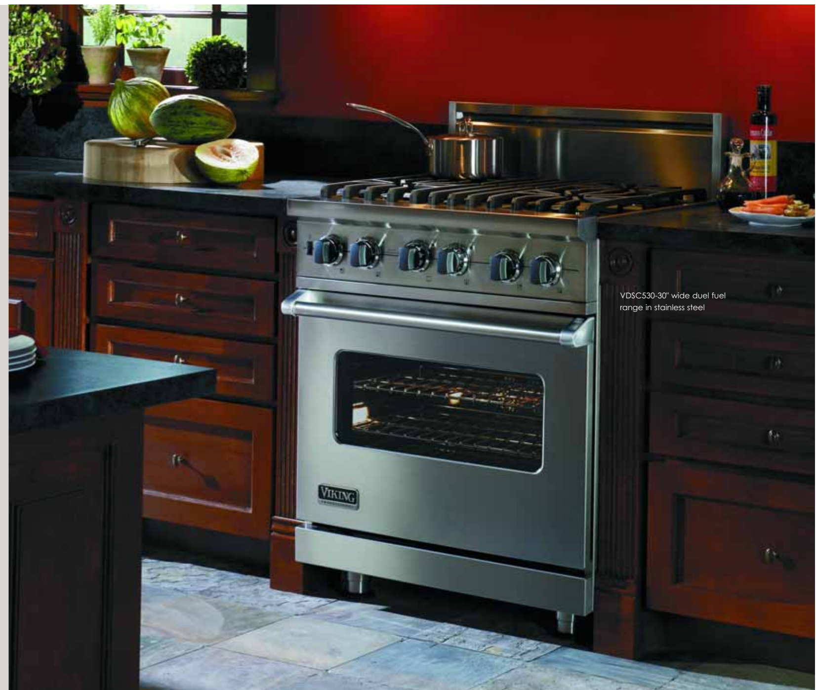
VDSC530-30" wide dual fuel range in stainless steel